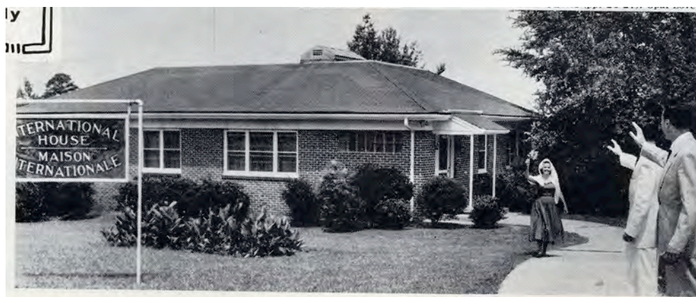
International House --- Maison Internationale constructed in 1949 by gifts from Alabama citizens