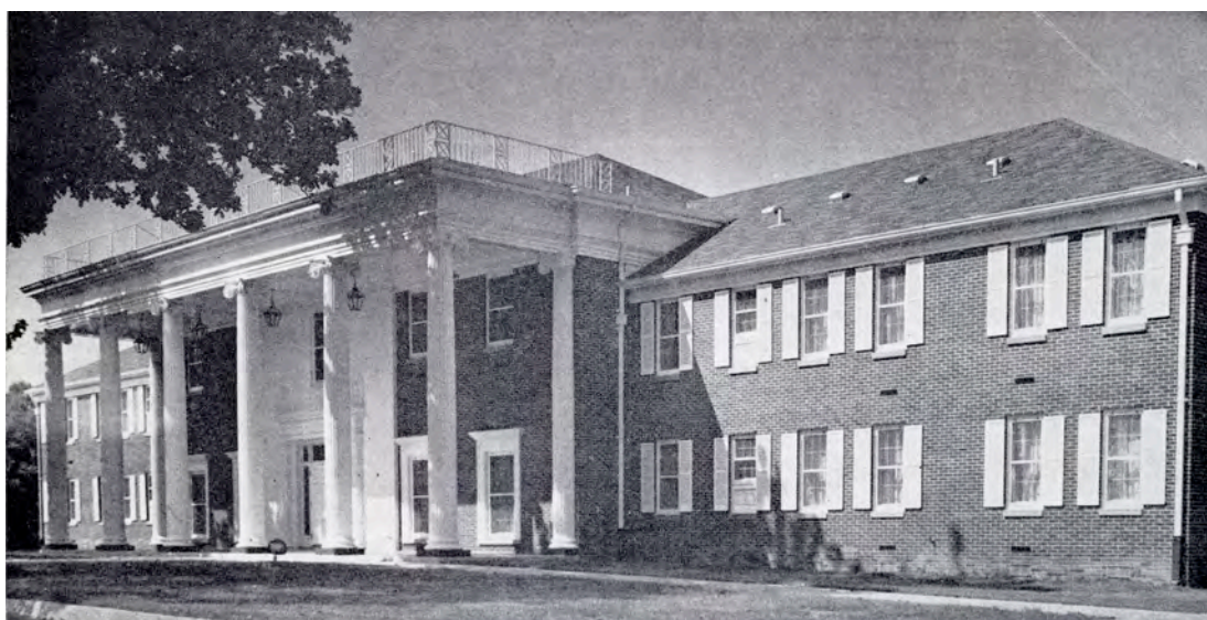
The Clarence W. Daugette International House constructed in 1964 .